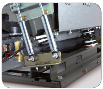
MDS SYSTEM INTELI CONTROL