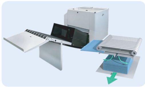
DROP PLATE STACKER