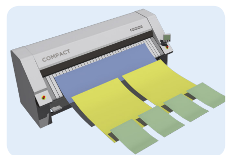
PROCESS A VARIETY OF ITEMS